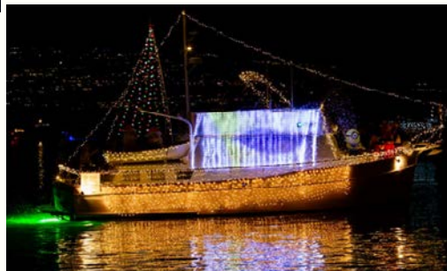
Power Over 34