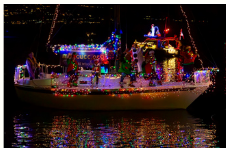
Sail Under 32