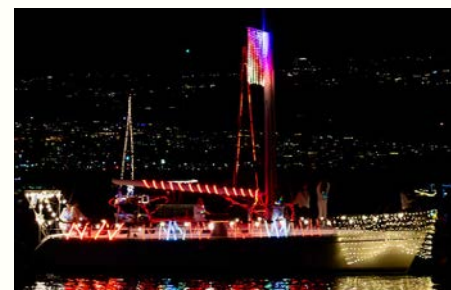
Sail Over 34