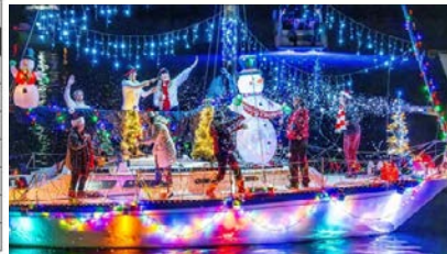
Exceptional Spirit (Oasis)