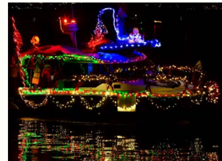
Power Under 34