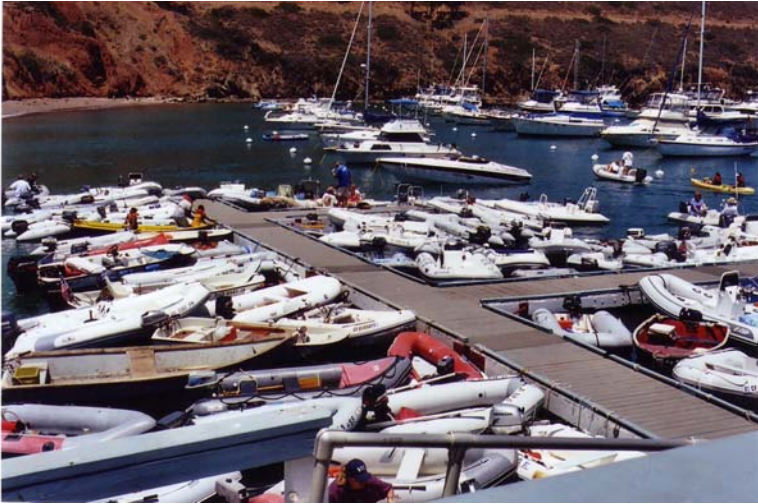
Dinghy Dock at the Isthmus the day of the Wine Festival (This is early on! Dinghies were triple parked by the time the Festival was in full swing!)