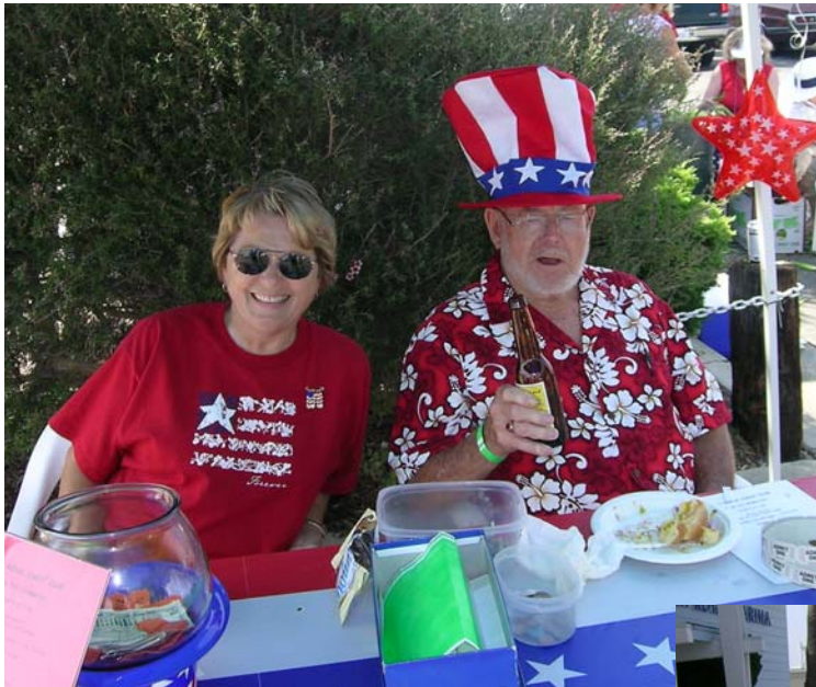
Uncle Sam selling tickets at the Fourth of July festivities